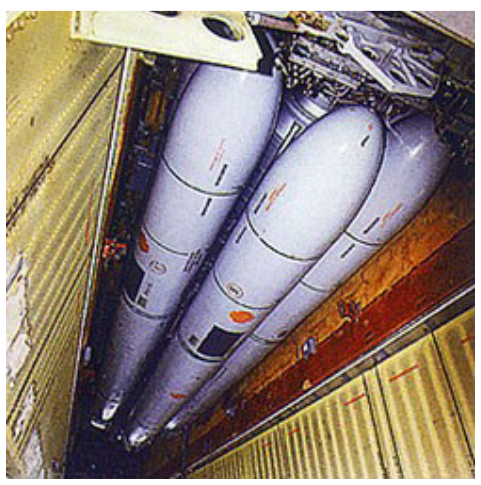
Kh-55 missiles in the internal rotary launcher

The Tu-160 was considered by the RuAF as the replacement for the Tu-95 [BEAR] family in the strategic strike role. However, production was stopped at 35 aircraft built; not enough for a country the size of Russia. Construction of additional Tu-160s has now slowly resumed. About every other year, a new or rebuilt Tu-160 is introduced to the Russian strategic air arm. It is unknown if Kazan will build more aircraft, or if the funding even exists to make them. The future will see the introduction of the Kh-555 precision-strike missile (Kh-55 [AS-15A Kent] missiles converted to a conventional role), the Kh-101 advanced conventional ALCM and the Kh-102, a nuclear version of the Kh-101. Of the Kh-101/102, the only feature known with certainty is that the seeker has new advanced technology, including image reference as well as terrain reference navigation (essentially emission-free terrain-following). The range is rumored to vastly exceed the 2500-3000km offered by Kh-55, reaching up to 4500-5000km. It is unknown what of the four power plant options (Turbofan, Turbojet, Unducted fan or Turboprop) will be used. What can be deduced however is that these missiles will be worthy successors for the Kh-55SM missiles currently used for strategic attack.