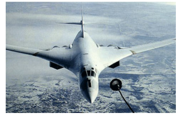
A Tu-160 approaches the drogue of an II-78 for a mid-air refuelling sequence

The other Tupolev supersonic bomber used by the RuAF is the Tu-160 [Blackjack]. This strategic bomber is bigger