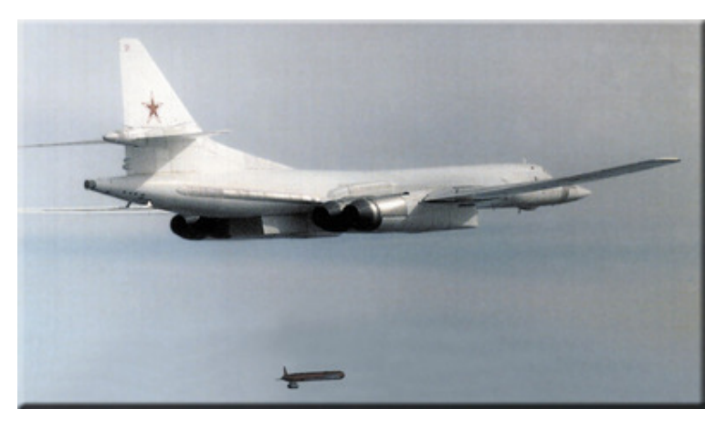
A Tu-160 releases a Kh-55 cruise missile during trials

Other missiles that have been tested on the Tu-22M3 but were not carried operationally include the Kh-31 [AS-17 Krypton] family of anti-radar and anti-ship missiles. Up to 4 can be carried on the external pylons. The Kh-55/RKV-