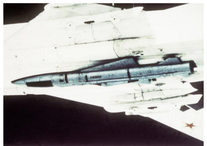
A Kh-22PSI is carried semi-recessed on the fuselage of a Tu-22M2

As far as missiles go, the Tu-22M2 was designed to carry the second generation of the Kh-22 [AS-4 Kitchen] family: The Kh-22M and the Kh-22MA. The second generation versions differ from the earlier models (Kh-22PSI) mostly in launch modes: they can now be launched at low altitude, at a reduced range. For nuclear attack the Tu-22M2 would still carry the older Kh-22PSI, limiting launch altitude to the high altitude band.