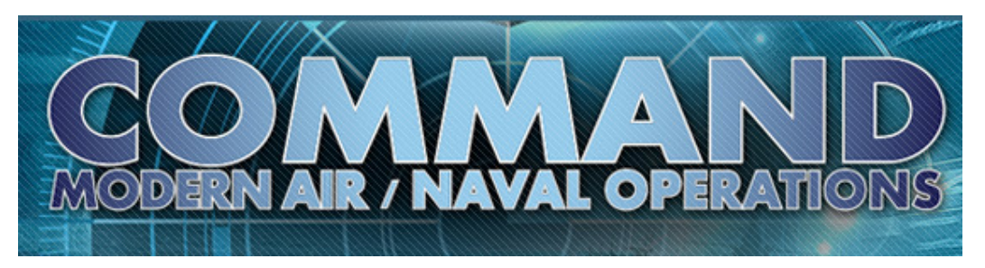
The gang that created the Waypoint magazine and resurrected the computer version of the Harpoon naval & aerial warfare simulator in the early 2000s, strikes again!

Command: Modern Air Naval Operations is the high-fidelity warfare simulator from WarfareSims.com . Combining massive scale (the entire earth is your theater) and incredible depth and breadth (conflicts from 1946 to 2020+) with unprecedented detail, realism and accuracy, a powerful Windows interface and challenging AI, Command has set the new standard for air-naval war games.